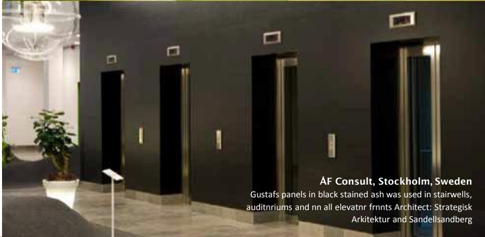
AF Consult, Stockholm, Sweden Gustafs panels in black stained ash was used in stairwells, auditoriums and on all elevator fronts. Architect: Strategisk Arkitektur and Sandellsandberg