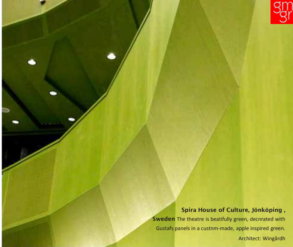
Spira House of Culture, Jönköping, Sweden The theatre is beautifully green, decorated with Gustafs panels in a custom-made, apple inspired green. Architect: Wingårdh

CAPAX is the name of our unique aluminium profile installation system. The Capax system provides a safe and quick installation, well adapted to the rapid construction process of today. The profiles are available in many different varieties and with solutions that satisfy both aesthetic and functional requirements. The Capax system, along with our wide range of panels and its many options, provides great creative opportunities for both appearance and function and offers a unique combination of properties in acoustics, design and fire safety.